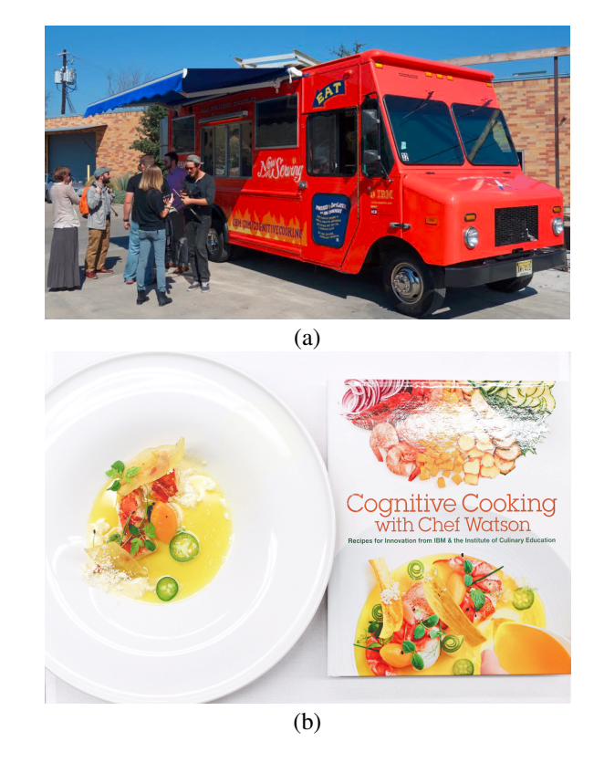
Figure 1: Embodiment of the Chef Watson computational creativity system that is completely hidden within (a) a food truck or (b) a published cookbook.

More broadly, general studies in the field of humancomputer interaction have demonstrated positive effects of physical embodiment on the feeling of an artificial agent's social presence (Lee et al. 2006). There are fundamental differences between virtual agents and physically-embodied robots from a social standpoint and have significant implications for human-robot interaction (Wainer et al. 2006; 2007), such as in the sense of authorship/inventorship and