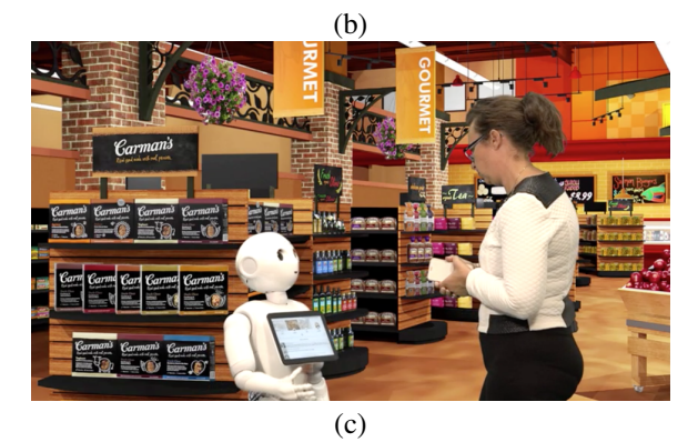
Figure 2: Several physical embodiments of the Chef Watson computational creativity system. (a) Virtual embodiment in a tablet computer. (b) Virtual embodiment in a smart appliance. (c) Physical embodiment in a humanoid robot.

Can machine-based innovations be protected so as to yield profits and appropriate upstream incentives? There are several possible approaches to this IP policy question. However, a central tenet of much copyright and patent law is that an IP right stems from and vests in a human creator or inventor, which would appear to constrain the available options. According to the U.S. Copyright Office, a work must be the product of "human authorship" to be entitled to copyright protection.<sup>2</sup> Although case law remains largely unsettled, it seems autonomously machine-created works that would otherwise be copyrightable would currently enter the public domain. In contrast, in the U. K. and Australia, there are provisions to assign IP ownership of autonomously-created works to a particular person (Fitzgerald and Seidenspinner 2013; McCutcheon 2013b; 2013a). Moreover, Bridy (2012) has put forth the work-for-hire doctrine as a mechanism for vesting ownership of copyright in AI-authored works.